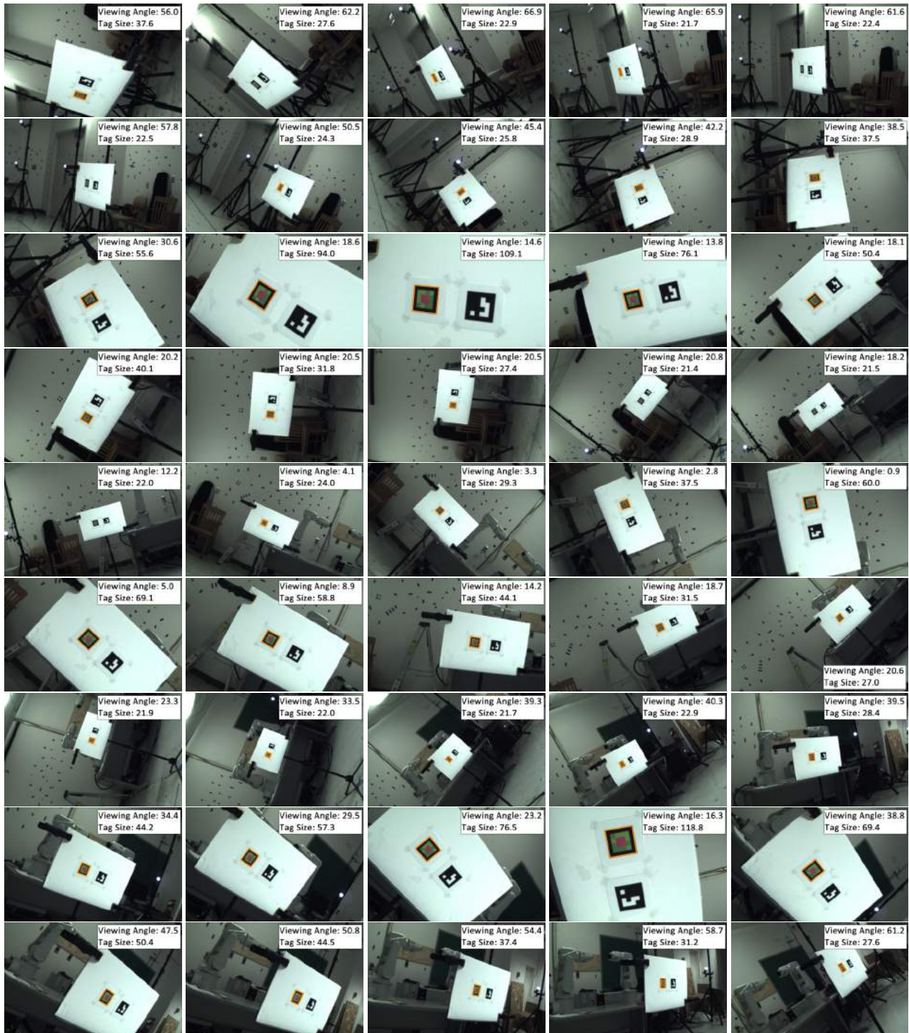
Figure 3: Example images processed by ChromaTag with labeled tag size and viewing angle.